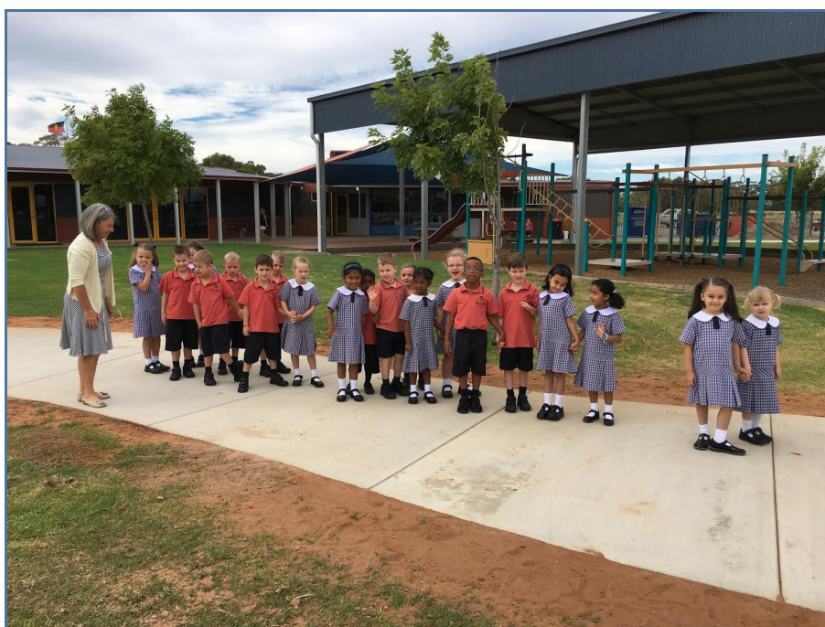
Turning back the clock. By welcoming students, we welcome Jesus.

Click here to see the full calendar of events or view via the skoolbag app under calendar