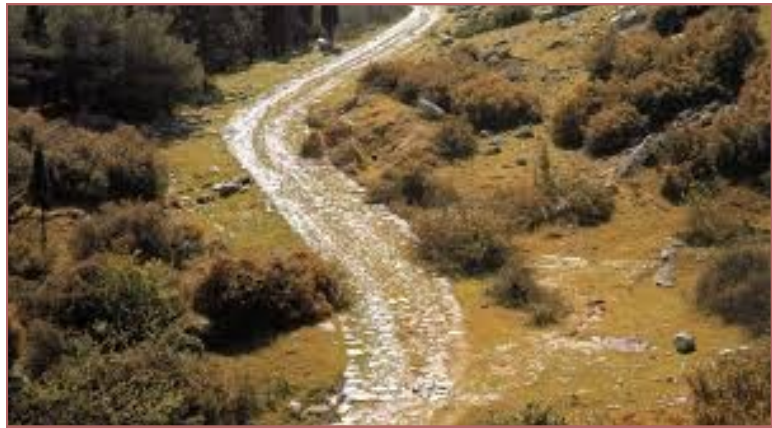
The Road to Our Emmaus