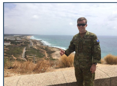
Daily brief Observation area