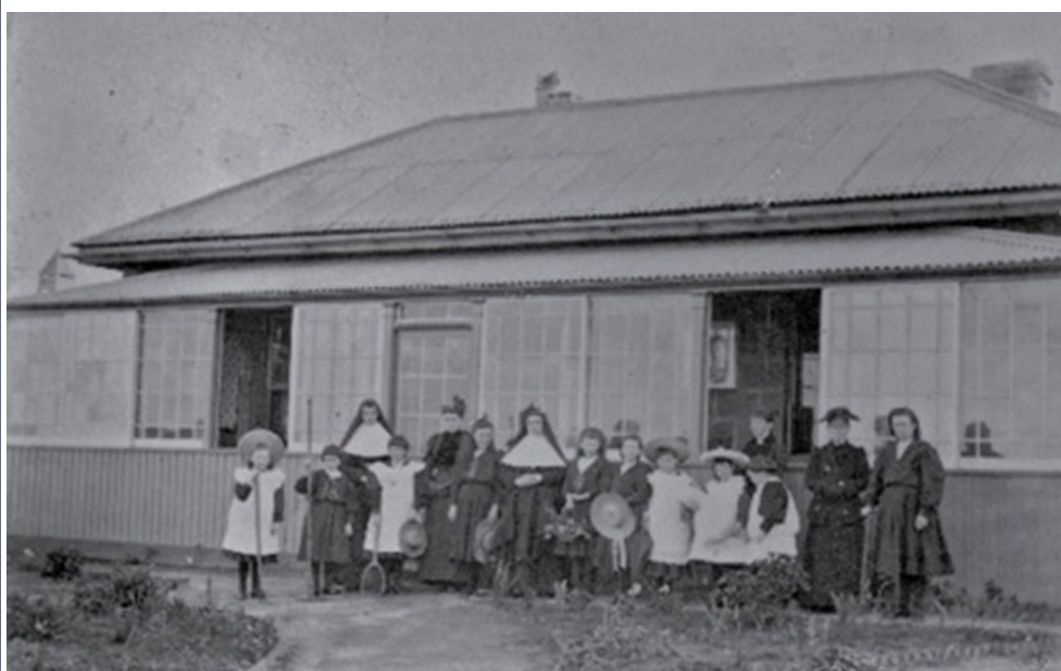
(Praying with Mary MacKillop, 2010)

St. Luke's Catholic Primary School acknowledges the Bangarang and Yorta Yorta people, the traditional custodians of the land on which our school is situated. We commit to working in partnership with Aboriginal people for reconciliation and justice.