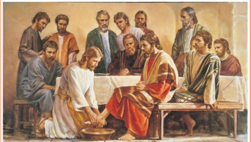
JESUS THE LEADER

We are all teachers! Reflect on this statement for a moment. Jesus wants us to learn, model and learn from others.