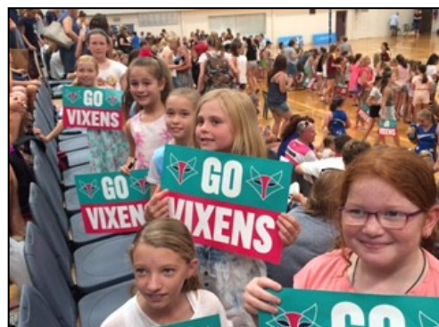
Our Girls enjoying watching the Melbourne Vixens play over the weekend at the Visy Centre.

And you never know. We may very well have a future state player come thru our ranks. Thru hard work and dedication, anything is possible!